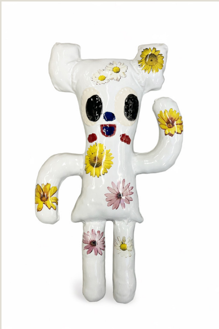
Photography | Cor Unum

You can request the photos by contacting us by email charlottelandsheer@gmail.com